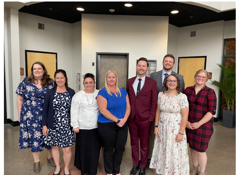
Left to Right: Graduates from the Utah Banker's Association Executive Development Course and Graduates from the First Community Bank Leadership Academy.