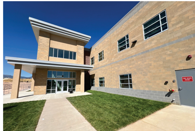
Photos of funded projects in 2024 including Springdale Hotel Partners in Zion, Utah and the Wallace Stegner Academy (Charter School) in Kearns, UT.